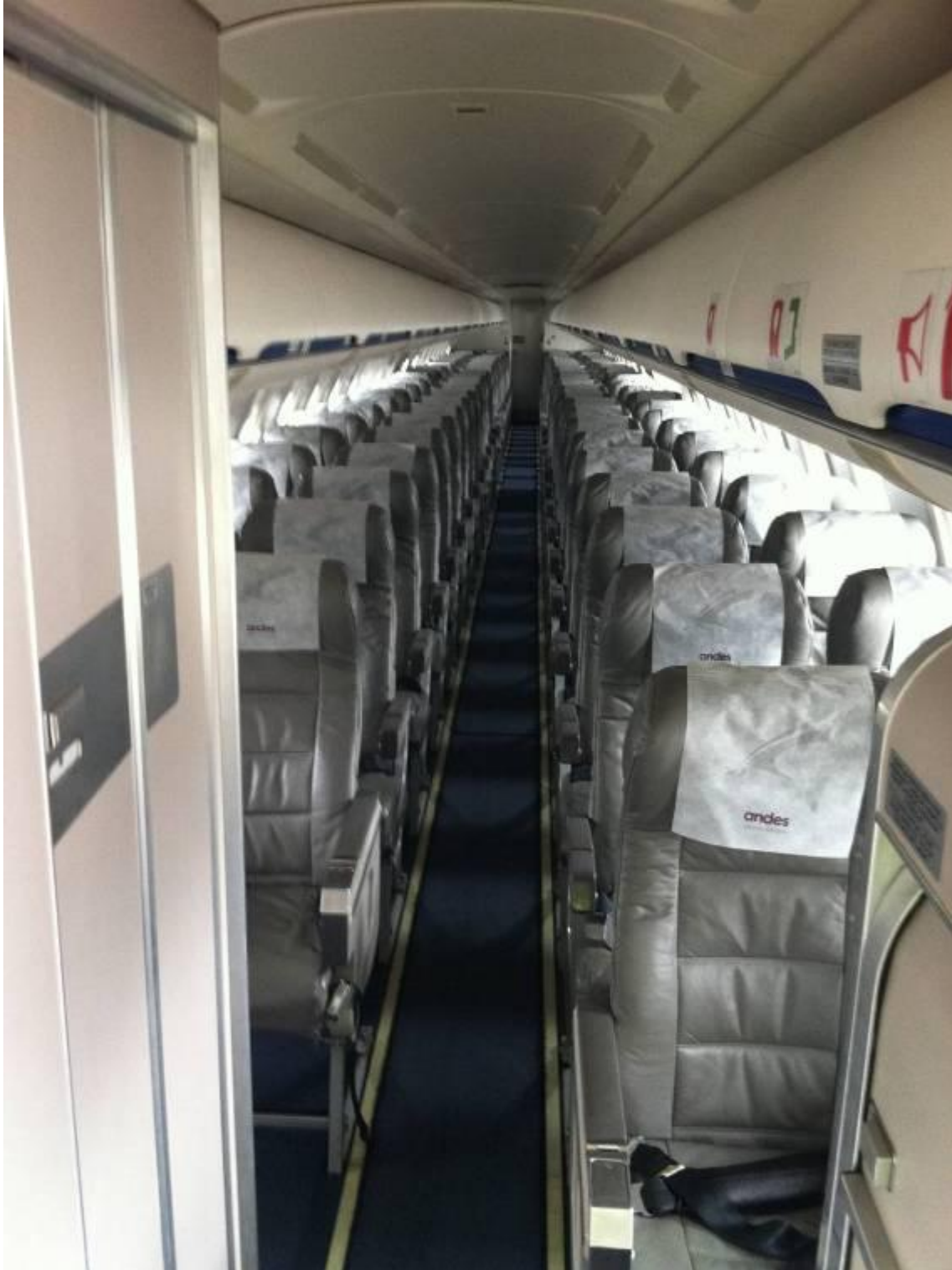
FWD lav and CABIN

The data herein is as of 1 st of June 2011 and is subject to verification due to demonstration and relocation flights.